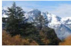
New Zealand: Stunning beauty, stupefying adventure (audio slideshow)