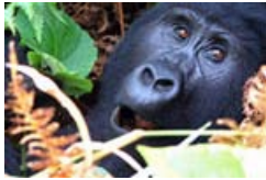
Woman escapes mundane with travel (audio slideshow)