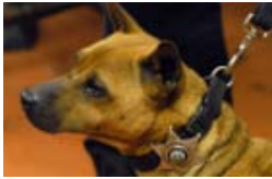
Police and their dogs work as one to apprehend criminals (video)