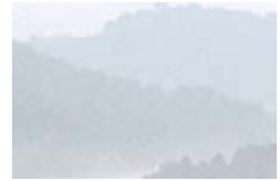
Multimedia journalism from the mountains